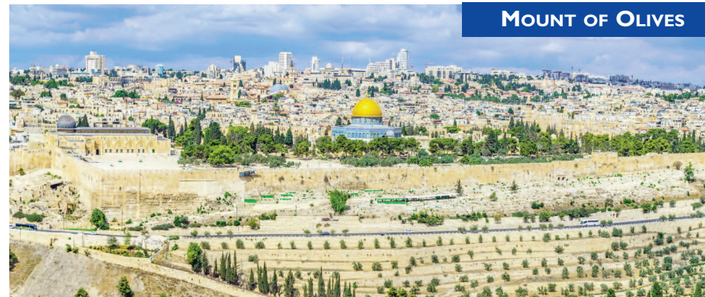
MOUNT OF OLIVES

Our day begins with a cable car ride to the mountain top fortress of